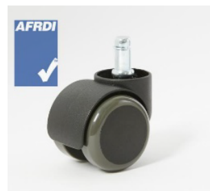
50mm Hooded PU (Polyurethane) Soft Tread Castor