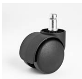
50mm Hooded Loaded Brake Castor (Brakes when loaded) 50mm Hooded Unloaded Brake Castor (Brakes when Unloaded)