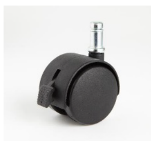
50mm Hooded Castor with Manual Brake