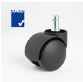
Standard 50mm Hooded Castor

Images are of 'Hooded Twin Wheel' Castors.