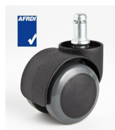
50mm Hooded Unloaded Brake with PU Soft Tread Castor (Brakes when unloaded)