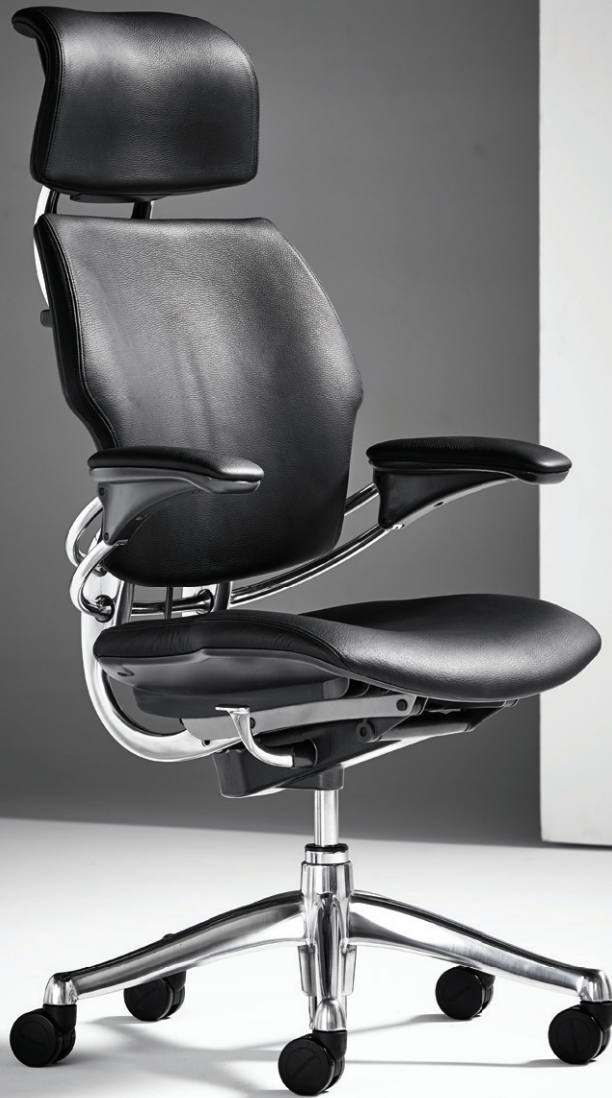
Freedom Headrest Chair, Ticino - Obsidian