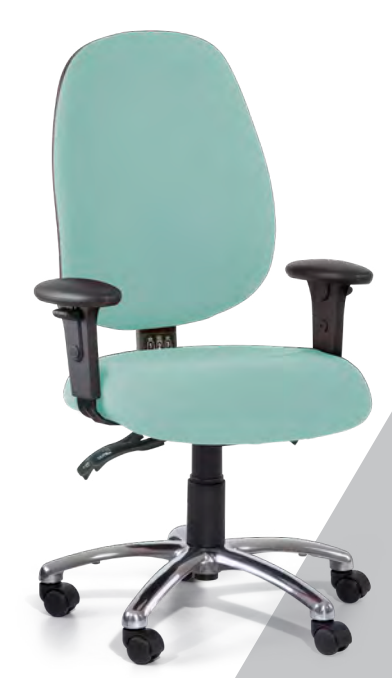
extra high back