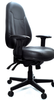
Featured with Leather Seated upholstery