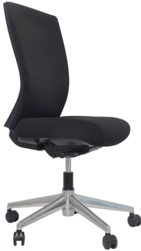
Buro Mentor chair with polished base