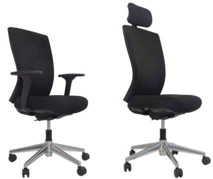
Featured with arms